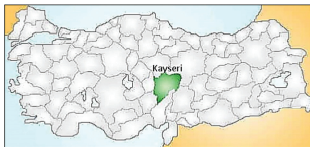
Figure 1. Location of Kayseri in Turkey [26].