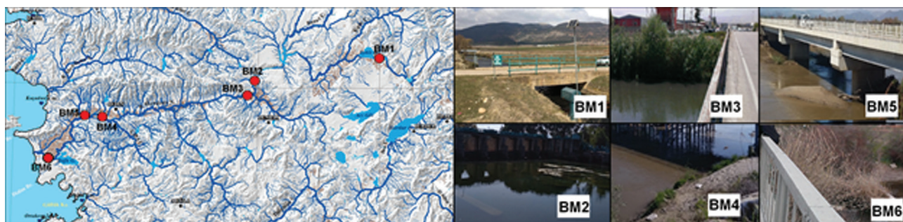
Figure 1. Location of the monitoring points on Büyük Menderes River.

Pollution Control Regulation Sampling and Analysis Methods Notification” published in the Official Gazette numbered 27372 and published on October 10, 2009. Water samples which were collected in dark colored glass bottles were delivered to the analysis laboratory as soon as possible under appropriate protection conditions. The sampling was carried out on a monthly basis between January 2016 and December 2018.