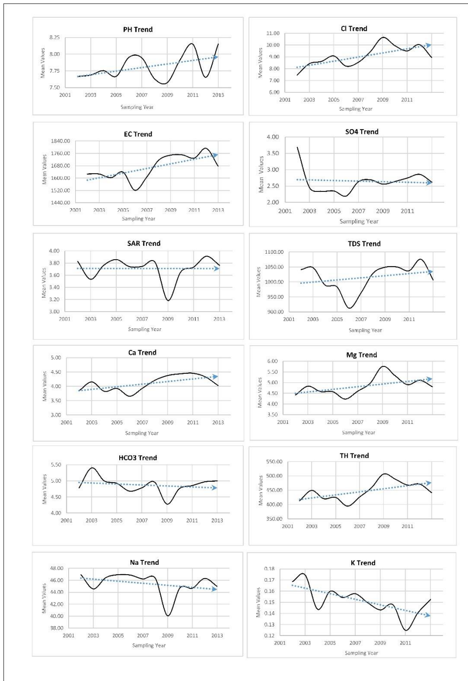
Figure 3. Temporal fluctuations of the qualitative parameters