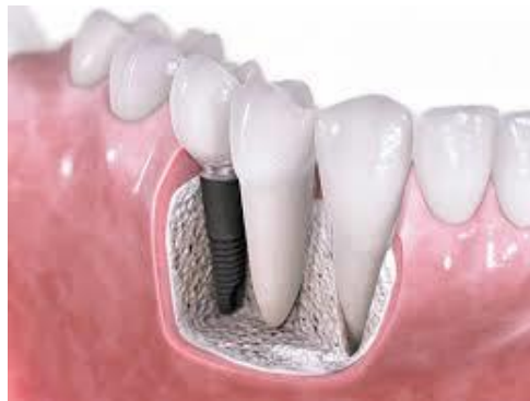
Figure 2. Dental Implant