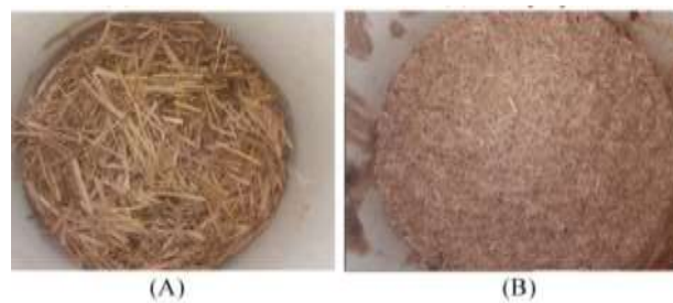
Fig. 1. Prepared stabilizers; (A) straw, (B) rice husk

The stabilizer straw was collected from rice field and chopped to the length of 40mm as it is recommended by Boudreau (24), refer to figure 1 (A). While the raw rice husk was collected from local rice mill, which was slightly compacted to reduce its pointed ends, refer to figure 1 (B). These stabilizers were added to the soil by the weight of dry soil, the proportion of dry mixture is presented in table 1. The water was added gradually to obtain the optimum plasticity and was kneaded manually for the proper consistency of mixture.