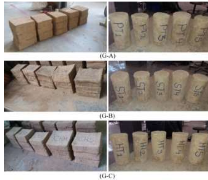
Fig. 2. Cured specimens from Group-A, Group-B & Group-C