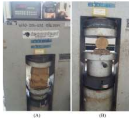
Fig. 3. Experimental set-up.